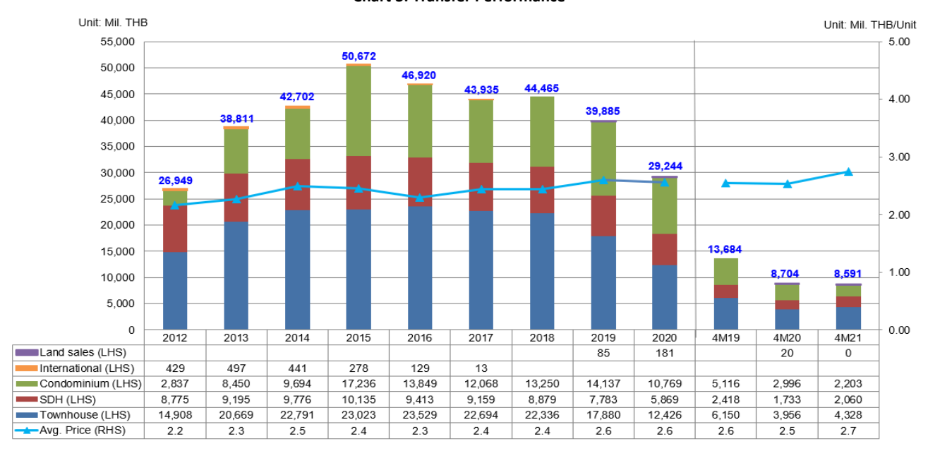
Chart 3: Transfer Performance