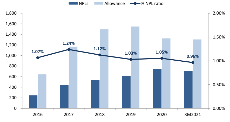
Chart 2: Asset Quality