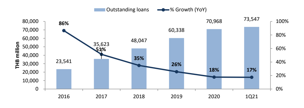
Chart 1: Outstanding Loans